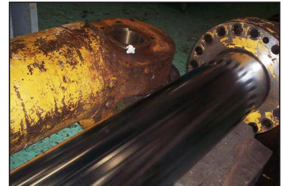
Arm cylinder was in excellent condition upon inspection.