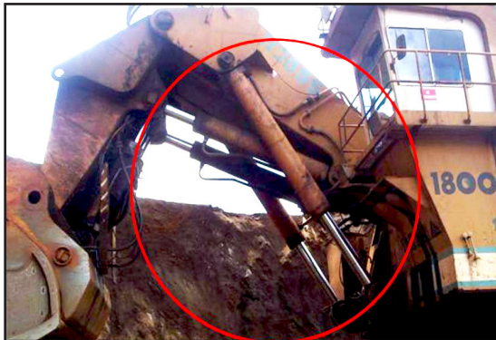
Demag excavator – Model H485.

Upon inspection, the wiper and rod seals were found to be damaged and could not withstand the severe hocking loading this equipment was exposed to.